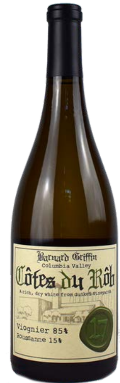
Côtes du Rhône Blanc