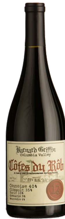
Côtes du Rhône Rouge

Our Côtes du Rhône is made as a blend of Southern Rhône grape varieties, and our Côtes du Rhône Blanc is a stunning harmony of Viognier and Roussanne.